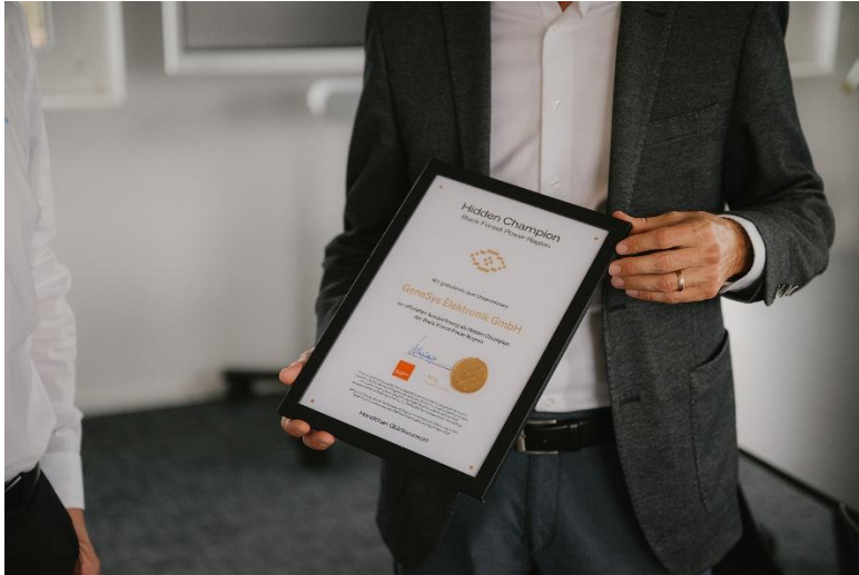
Award: GeneSys Elektronik is a hidden champion