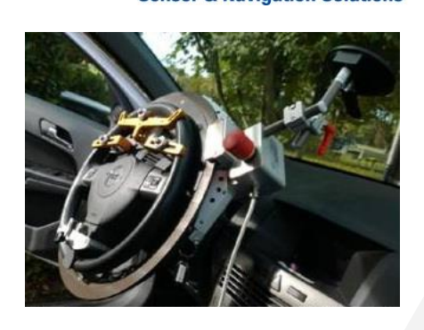
Steering wheel fixation

Alternatively, correction data can be obtained from private operators such as SAPOS, AXIO-NET or HEXAGON using NTRIP modem.